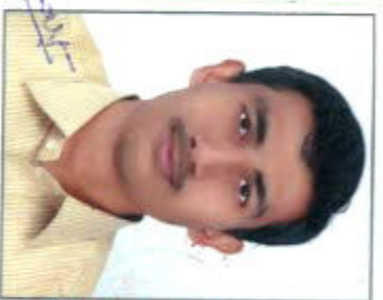
Deponent No 1