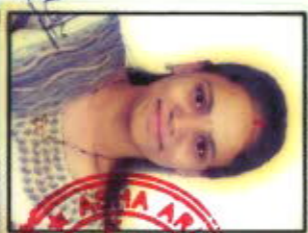
Deponent No 2