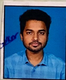
DEPONENT 2 (Husband)