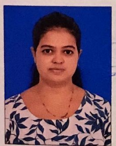
DEPONENT 1 (Wife)