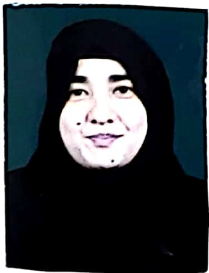
DEPONENT 1 (wife)