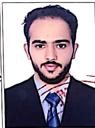
DEPONENT 2 (Husband)