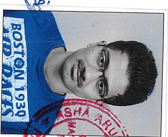
Deponent No 1