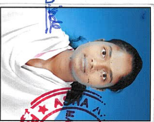
Deponent No 2