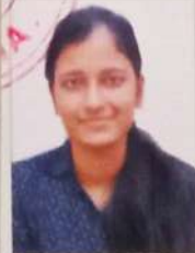
Deponent No. 2

REGISTERED SR No. 111/93 11 JUL 2023 of NOTARY REGISTER