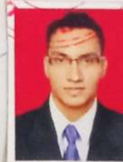
Deponent No. 1