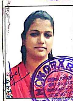
DEPONENT NO. 2