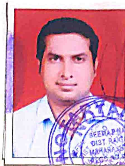
DEPONENT NO. 1