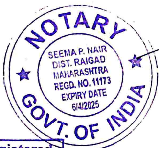
DEPONENT NO. 1