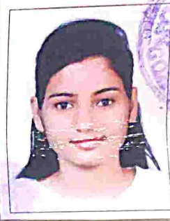
DEPONENT NO. 1