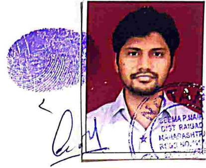
DEPONENT NO. 1