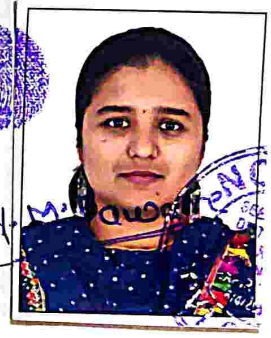
DEPONENT NO. 2