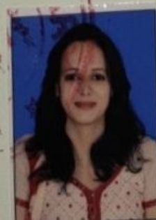
Deponent No. 1