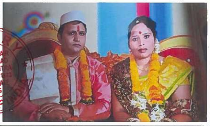
DEPONENT No.1 (Husband)