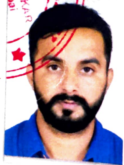
Deponent No. 1