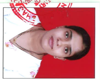
Deponent No 2