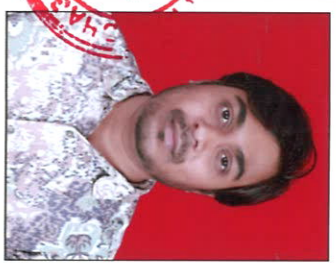
Deponent No 1