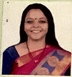
(1) Deponent/Signature of Wife