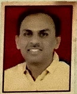
(2) Deponent/Signature of Husband