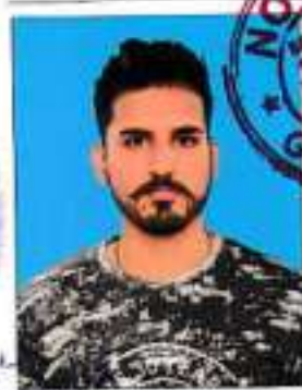
DEPONENT NO. 1