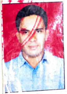
Deponent No. 1