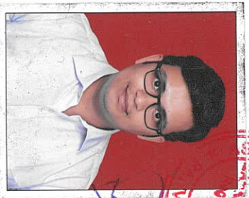
Deponent No 1