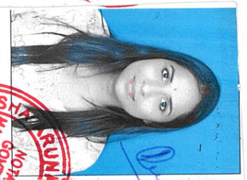
Deponent No 2