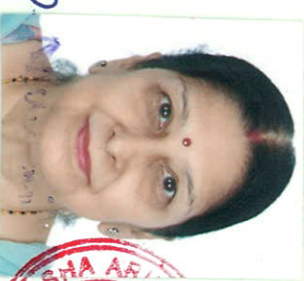
Deponent No 2